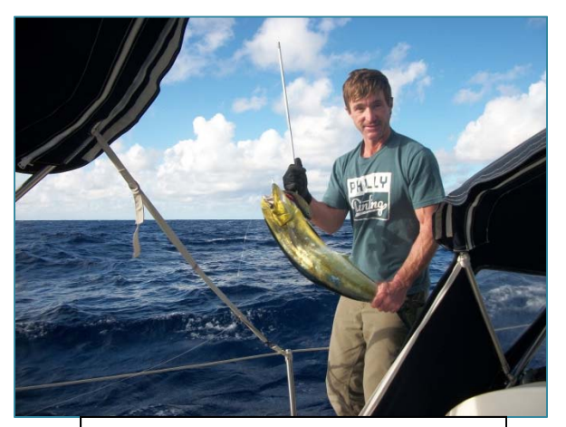
Catching Dinner While Underway

Learn skills required to safely sail offshore for an extended period while accompanying us as we move our teaching vessel, Gallivant to the Caribbean in the fall and back in the spring. 9-13 day, live aboard classes, which provide students with an understanding of yacht preparation for ocean sailing, course planning, working a watch schedule, use of celestial navigation, weather analysis, storm avoidance, heavy weather sailing techniques including use of drogue and storm jib, use of radar, techniques for crossing the Gulf Stream, and other elements involved in ocean passage making. All classes taught by an ASA certified and USCG licensed captain.