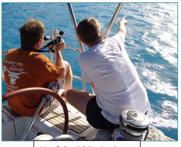
Use Celestial Navigation